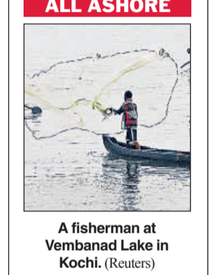
A fisherman at Vembanad Lake in Kochi.