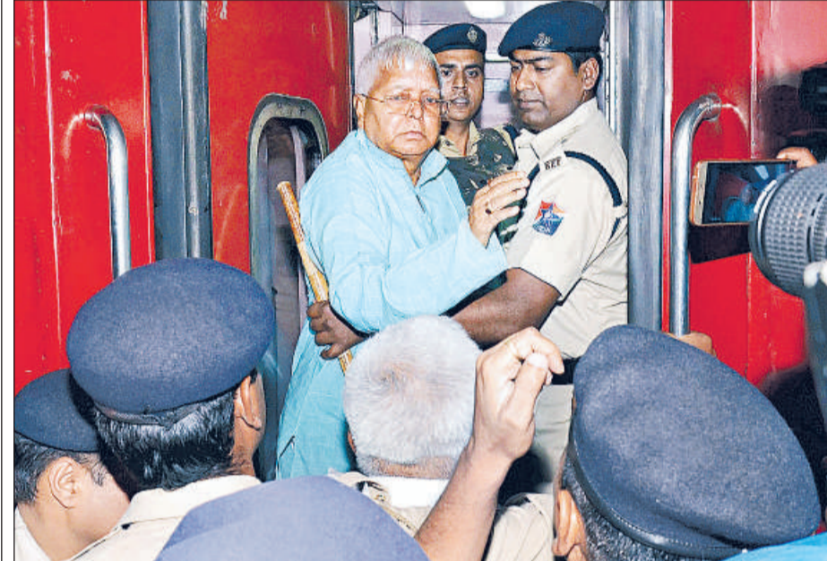
Former Bihar chief minister and RJD chief Lalu Prasad Yadav leaves for Delhi's All India Institutes of Medical Sciences from Ranchi after his health deteriorated on Wednesday.

OUR LEGAL CORRESPONDENT New Delhi: The government on Wednesday said it wouldn't exclude the more affluent among Scheduled Castes and Scheduled Tribes from reservation benefits, contending in the Supreme Court that the creamy layer concept for the Other Backward Classes couldn't be applied to these two communities. Under this concept, the more well-to-do among OBCs can be denied quota benefits. "This principle cannot be applied to the presidential order on quota for SC/STs. The government of India will not remove any creamy layer from among the SCs and STs from the purview of reservations," additional solicitor-general P.S. Narasimha told a bench of Chief Justice Dipak Misra and Justice A.M. Khanwilkar. According to Article 341, the President can issue an order declaring certain castes/race/groups as SCs and STs.